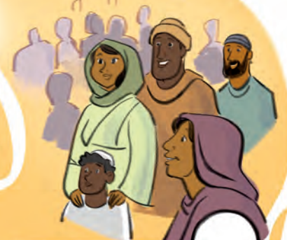
The Jews were amazed to hear the disciples speaking in their own languages.